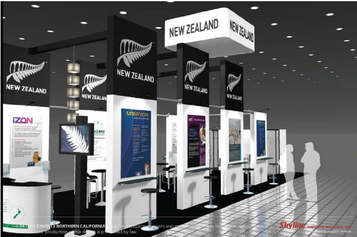
View from front right corner