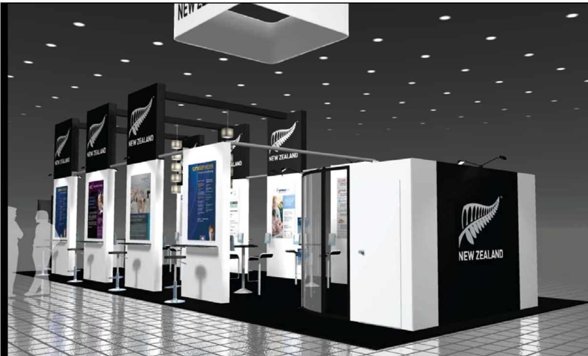
View from rear right corner